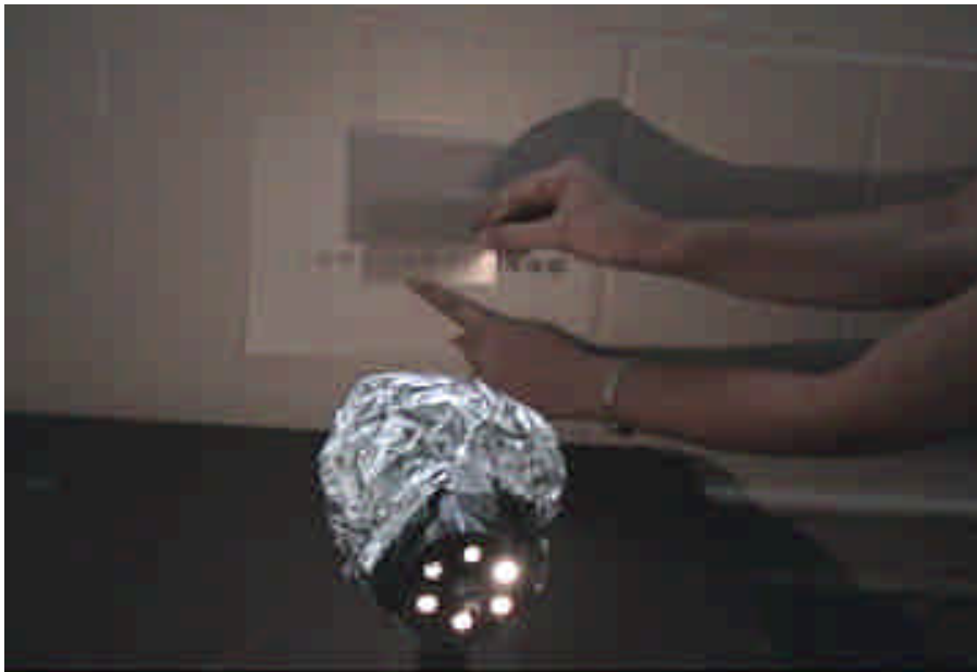
Table 1. Light attenuation exercise

The learners tape the light intensity scale to a wall and set up the lamp to shine on the scale. When ready, the learners take a piece of foil with a hole the diameter of a thick pencil or pen and place it over the lamp. (Learners are cautioned to not leave the foil on the lamp long while the lamp is on, as heat will be trapped and increase the risk of bulb breakage.) The learners then darken the room, hold up a piece of transparency film a few centimeters in front of the light intensity scale, and match the intensity of the resulting shadow with a square on the scale as shown below in Figure 1. After recording this intensity in a data table (Table 1), the learners then repeat this process with two sheets of transparency film, then three, and so on.